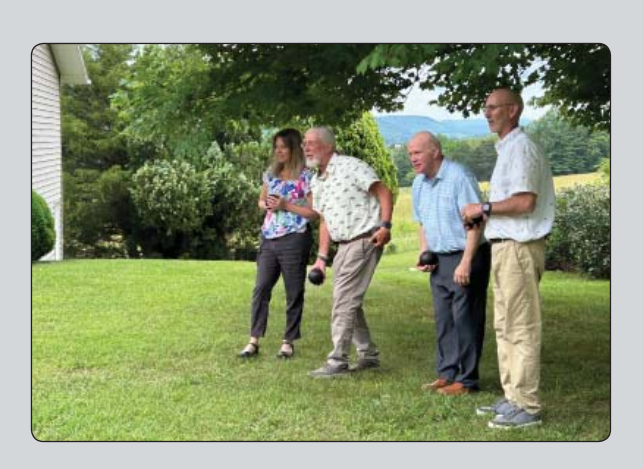
Follow us on Facebook: saintpeterscallaway

We pray also for all those who were killed this week as a result of war and terrorism, and for families whose lives are being torn apart. Almighty God whose will it is to hold both heaven and earth in the peace of your kingdom, give peace to your Church, peace among nations, peace in our homes, and peace in our hearts.