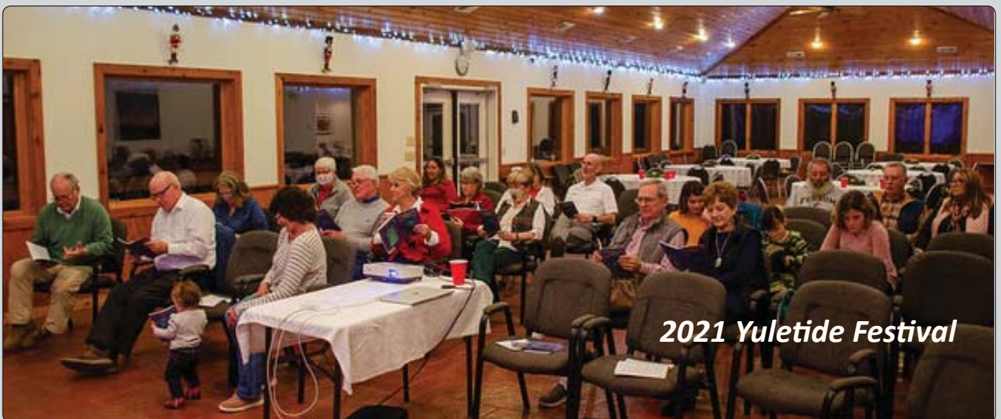
2021 Yuletide Festival