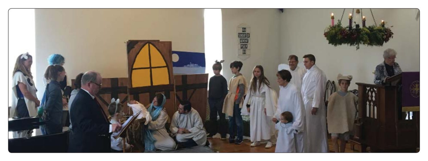
Nestled in the Stable Saint Peter's in-the-Mountains Christmas Program | Sunday, December 22, 2019