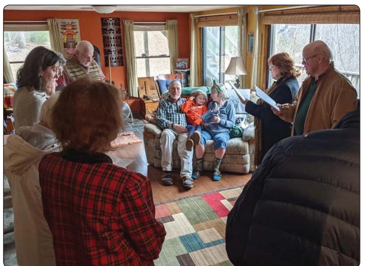
A group of folks from St. Peter's-in-the-Mountains visited the Pohlad-Thomas home to sing Christmas carols following the church Christmas program on Sunday, December 22.