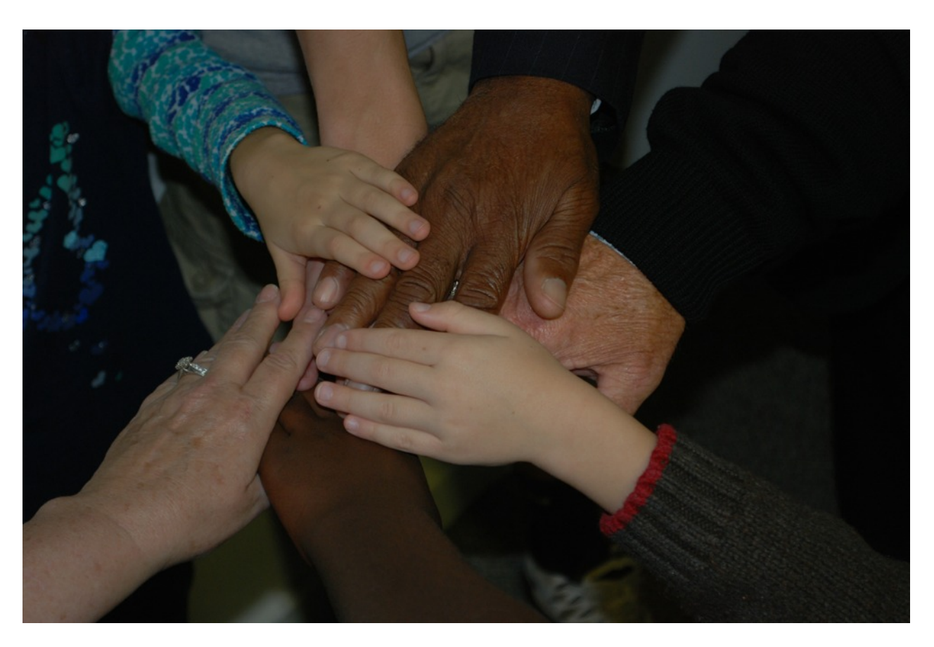
(Some of) the hands of Saint Peter's.