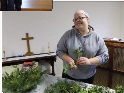
Wreath making at Saint Peter's Saturday, November 30.