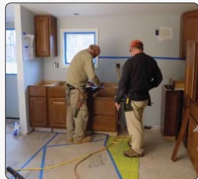
Habitat for Humanity project Saturday, November 30.