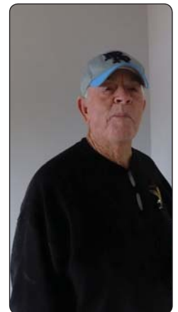
Saint Peter's and PNC helping out with a Habitat for Humanity project on Nov. 30.