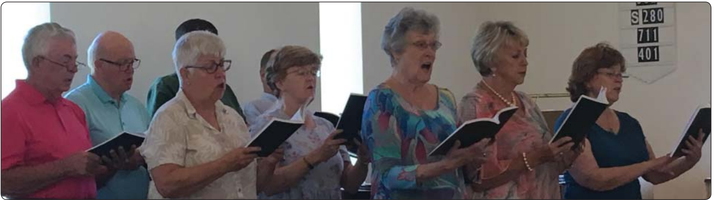
St. Peter's Choir