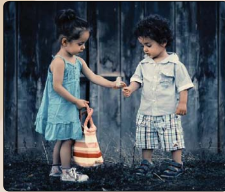
Story & photo from alltimeshortstories.com .

A little boy and girl were playing together. The boy had a collection of beautiful marbles, while the girl had some candies with her. The boy offered to give the girl all of his marbles in exchange for all her candies. The girl agreed right away.