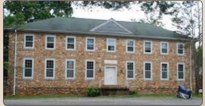
Phoebe Needles School