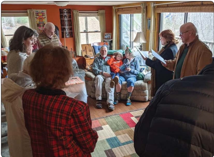
A group of folks from St. Peter's-in-the-Mountains visited the Pohlad-Thomas home to sing Christmas carols following the church Christmas program on Sunday, December 22.