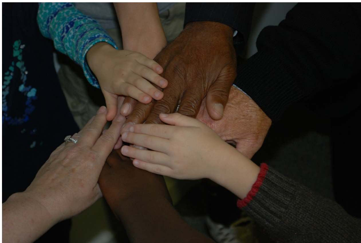
(Some of) the hands of Saint Peter's.